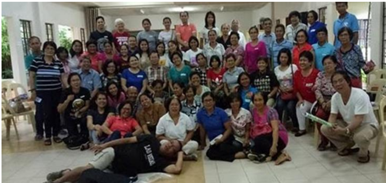
63 participants, BEC Coordinators, Animators & Organizers