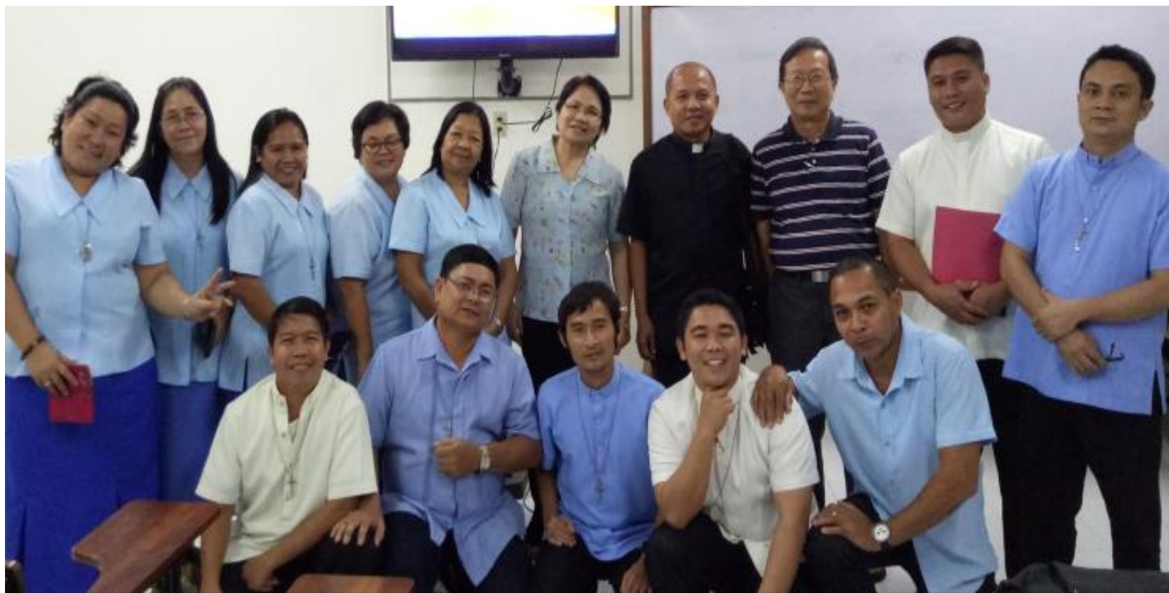
Trainors Development Workshop, October 26-28, 2016 with the priest, novices and lay formators of Mary's Little Children Community, Minglanilla, Cebu