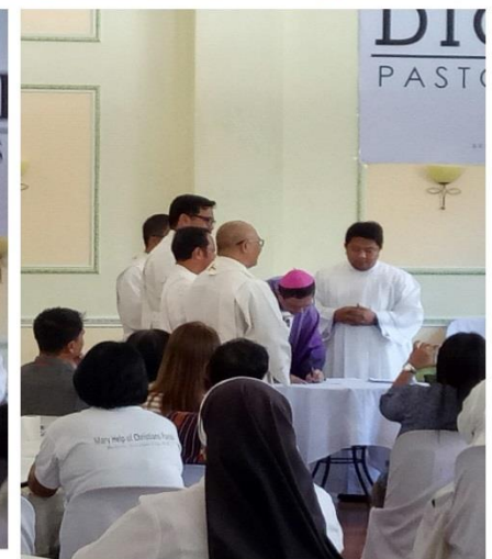
Diocesan Pastoral Planning, Diocese of San Jose de Nueva Ecija, Francesko Hotel, N.E. March 10 & 11, 2017