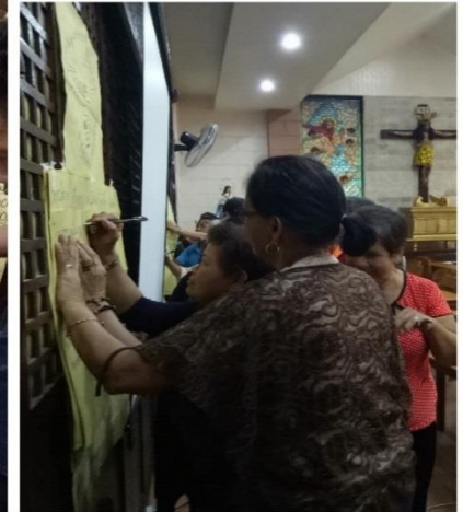
Appreciative Inquiry BEC planning, Diocese of Novaliches, February 16, 2017