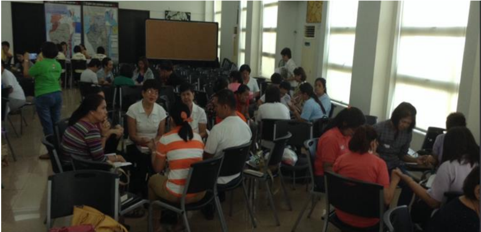
Diocese of Paranaque, BEC Parish Leaders in actual Lectio Divina. May 14, 2016